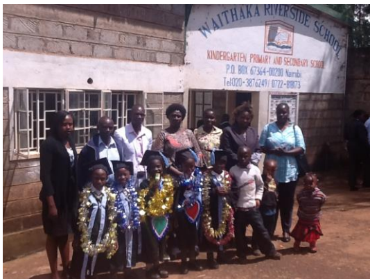
Graduation pictures of the younger children.