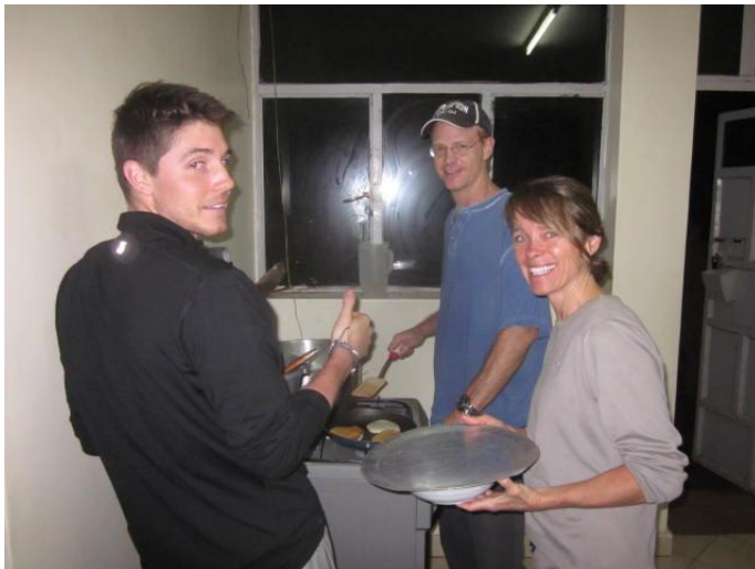
Volunteers making pancakes!

"How glory be to God! BY His mighty power at work within us, He is able to accomplish infinitely more than we would ever dare to ask or hope." -Ephesians 3:20