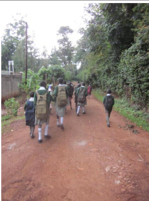
Off to school they go!