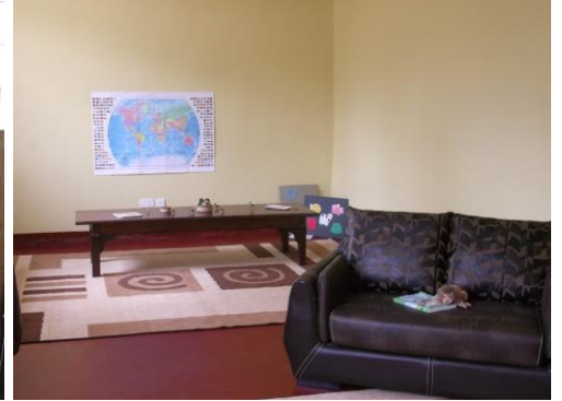
Library (aka soon-to-be dance hall)