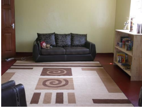
Library (aka Play room)